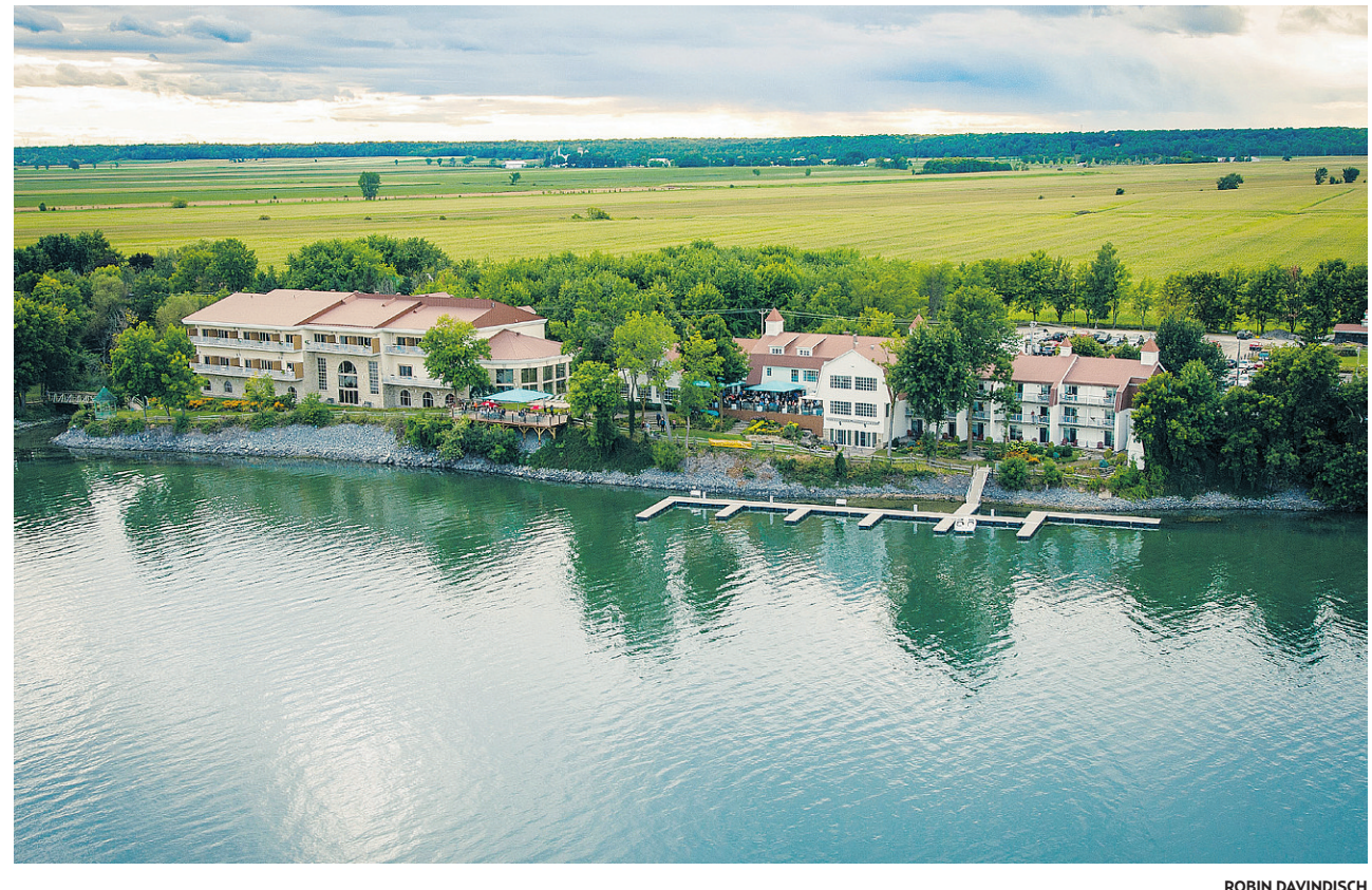
Les Trois Tilleuls Hôtel & Spa is undergoing a top-to-bottom renovation — including large new deck and chic outdoor living room — but its gorgeous setting on the Richelieu River will not change.

It wouldn't be an authentic Richelieu River scene withcan power up your yacht or our gorgeous setting."